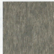
Recycled - Gray