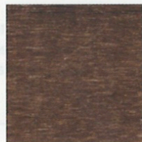
Recycled - Dark Brown