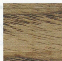
Boulevard Wood - Ash