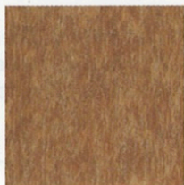
Recycled - Cedar