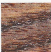
Boulevard Wood - Treated Ash