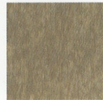
Recycled - Weathered Wood